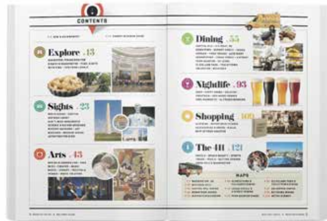
WASHINGTONIAN WELCOME GUIDE Washingtonian’s biannual ancillary publication.