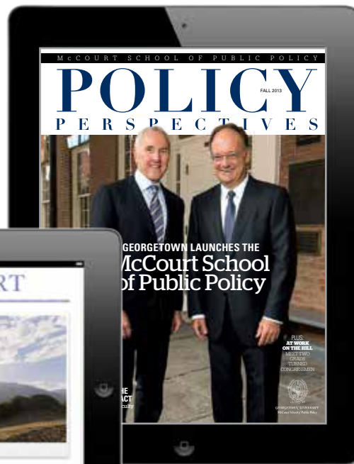
POLICY PERSPECTIVES The fall 2013 digital edition.

Over half of American magazine readers access magazine content and advertising through digital channels including smartphones, eReaders, tablets, and other mobile devices. (media-post.com)