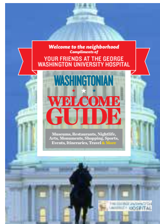
WASHINGTONIAN WELCOME GUIDE Custom Branded Banner

Successful people read up to five magazines over the course of a month, according to a 2012 study. [forbes.com]