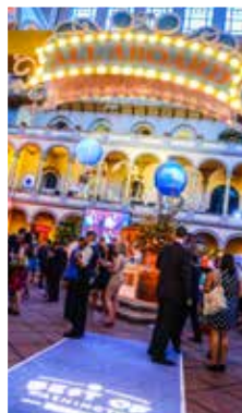
BEST OF WASHINGTON PARTY 2013 2,000 guests filled the National Building Museum for sips and bites from the Washingtonian 100 Very Best Restaurants issue.