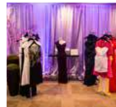
UNVEILED Washingtonian Bride & Groom hosted its sixth annual Unveiled wedding showcase at the Park Hyatt Washington DC on January 26.