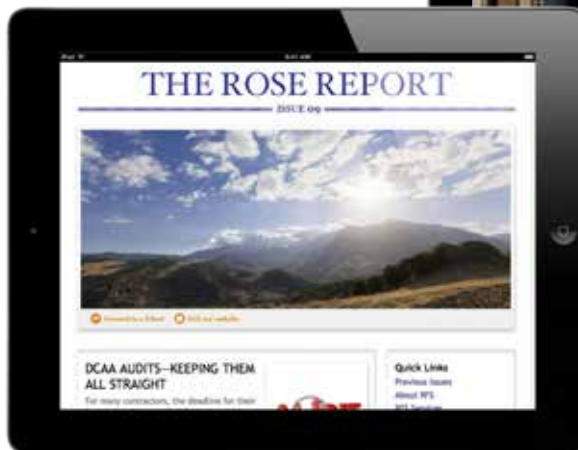
THE ROSE REPORT Rose Financial Services' e-newsletter.